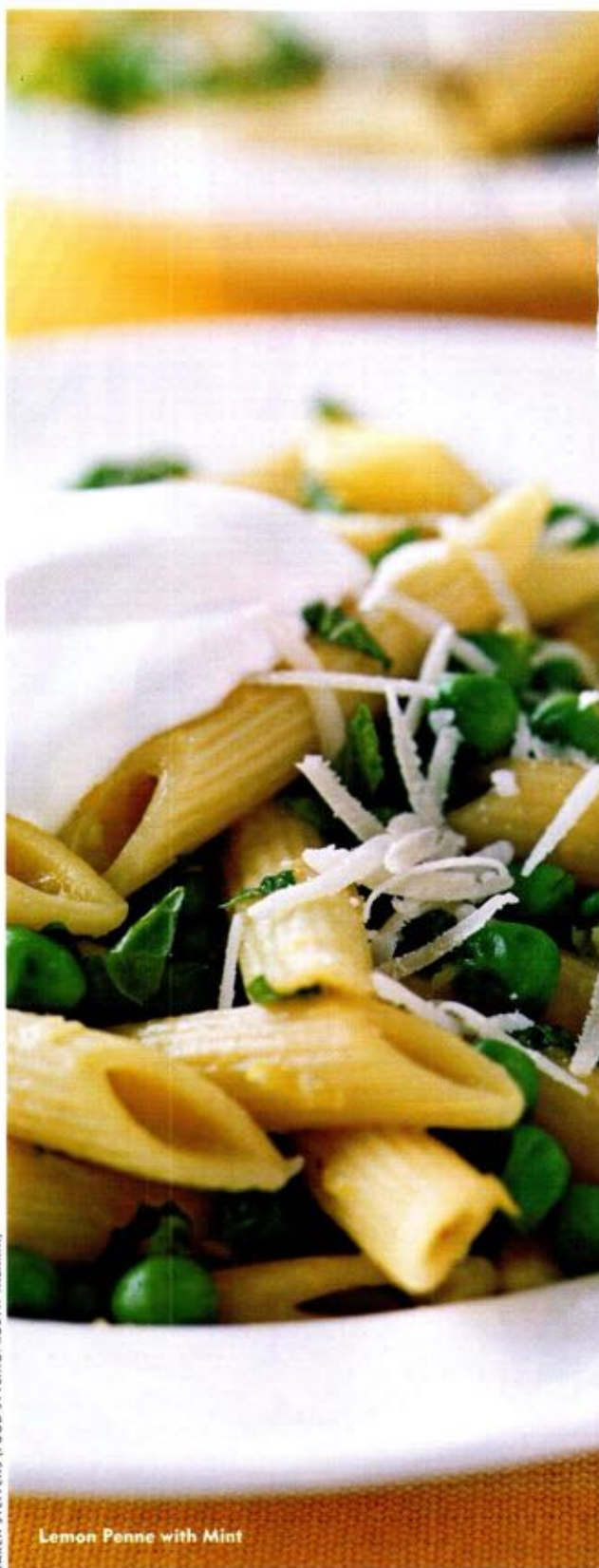
Lemon Penne with Mint

Per serving: 217 cal., 32% (69 cal.) from fat; 5.1 g protein; 7.7 g fat (4 g sat.); 33 g carbo (0.2 g fiber); 145 mg sodium; 122 mg chol.